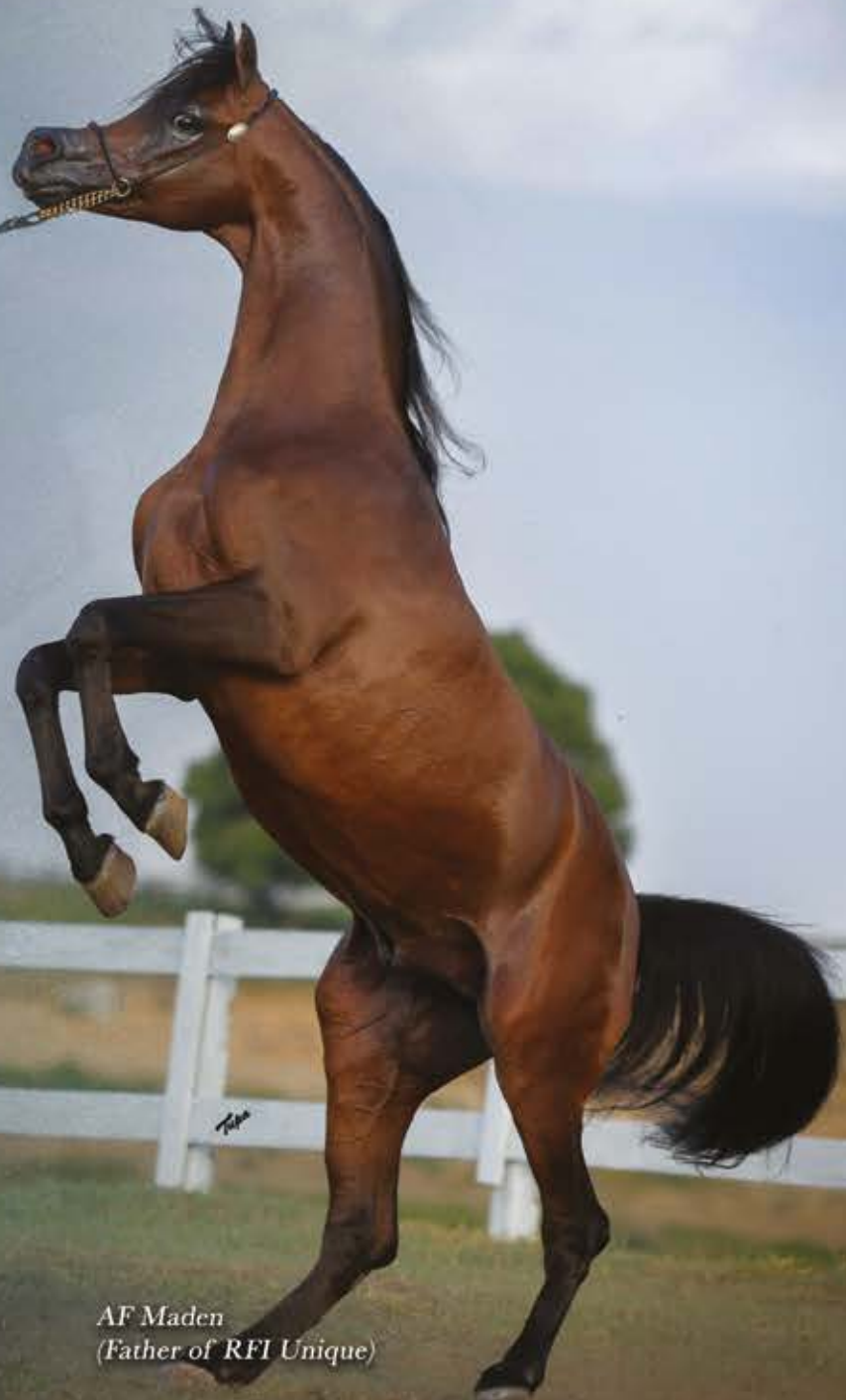
AF Maden (Father of RFI Unique)