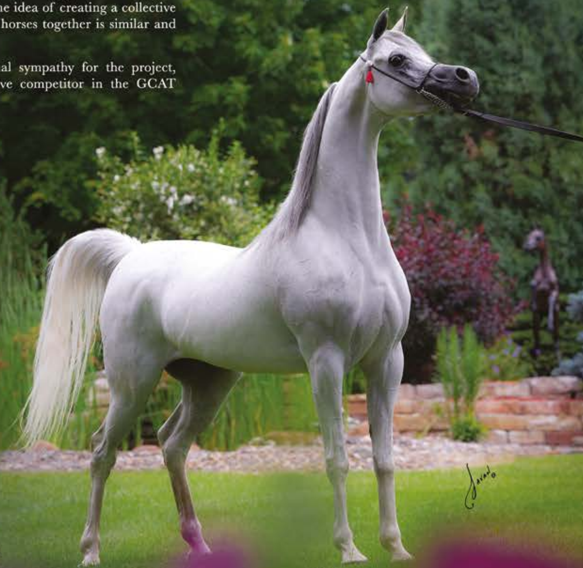
Wiezas Diamond ORA

In North America the Alves family is proudly represented by two exceptional contenders who were both finalists in the overall top five winners of the circuit.