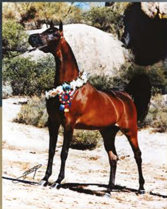
Europa El Jamaal

Also internationally known is his impressive collection of stallions both acquired through the years and homebred, such as *Style SRA, AF Maden, *Pscore, Sir Fames HBV, *Jullyani, *Imagine, *Perignon, *Vaalente, *FA Rajjah, *Sirajj UB, *RD Capriotti, *Supreme Justice ORA, *GP Beau, Yllan El Jamaal, Brioni Carol, *Laddin BA, Luigi HVP, Abbas Al Ventur, Paladino Al Ventur, Shaezz El Madan, Prince Magnum JSZ, Yparadise JM, Ballack Di Vitorio JM, Ceazzar Ever JM, the brothers Calvin Del Tino JM and Cash Del Tino JM, El Kaizer Ali JM, Firenze D'Yparadise JM, Fugatti Del Tino JM, Gallax D'Ambition JM.