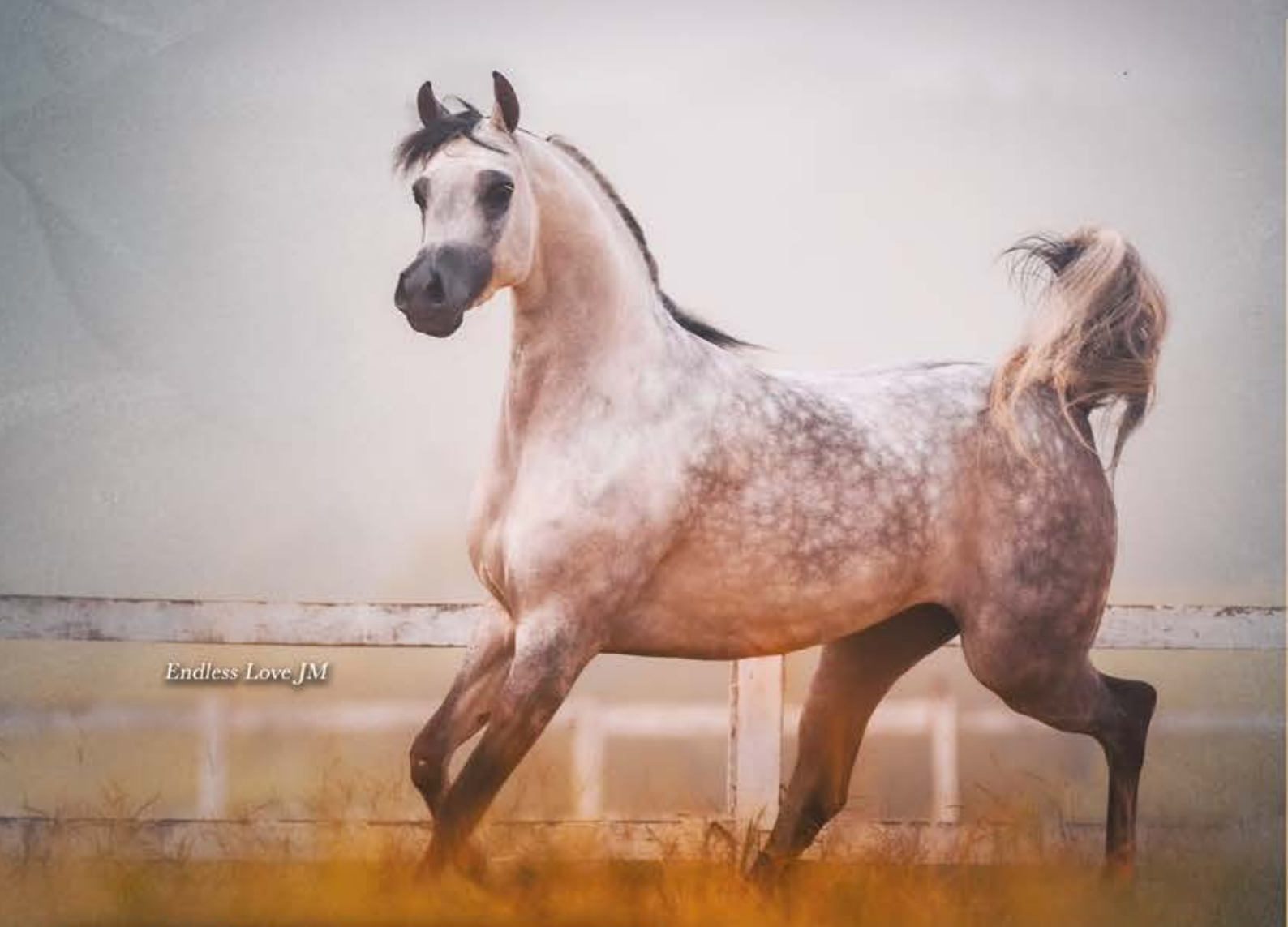
Endless Love JM